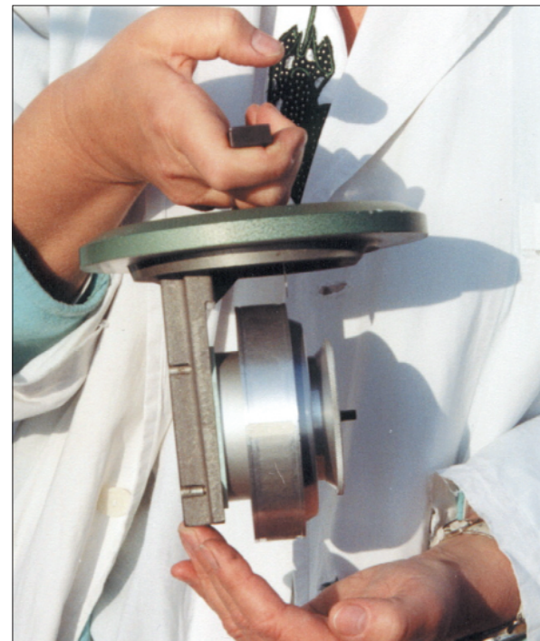
Fig. 2. 7-day volumetric trap

deposited by inpaction on tape. The air flow is provided by an external vacuum pump and it must be constant, it is usually 10l/min. Therefore the spore trap samples 0.6 m³ of air per hour (14.4 m³ every day). In the Hirst volumetric type traps, the samplers can be obtained weekly (fig. 2) or daily (fig. 3). In 7-day trap sampling is carried out weekly. A polyester Melinex tape, about 345 mm long (48 mm/day x 7 + 9 mm for mounting a tape) which corresponds with seven days of week.