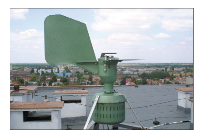
Fig. 1. Burkard volumetric trap

In most European countries the monitoring of airborne particles is carried out using the volumetric