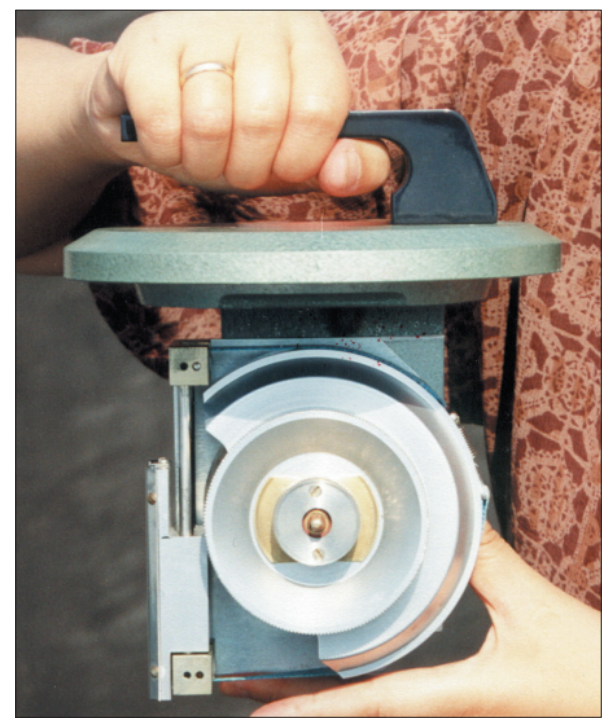
Fig. 3. 24-hours volumetric trap